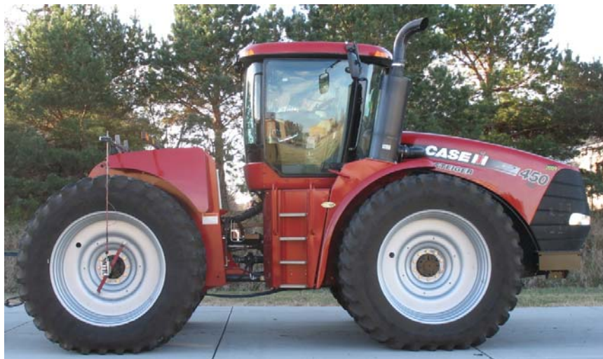
Case IH STEIGER 450 Diesel

Institute of Agriculture and Natural Resources University of Nebraska-Lincoln