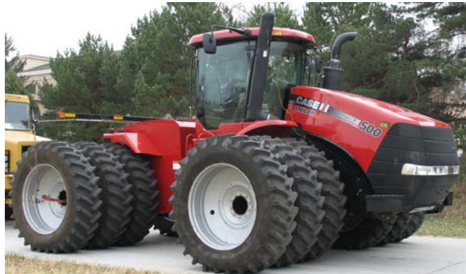
CASE IH STEIGER 500 Diesel

Institute of Agriculture and Natural Resources University of Nebraska-Lincoln