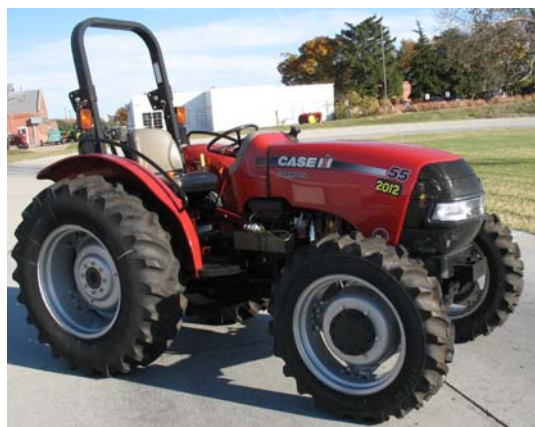
Case IH Farmall 55A Diesel