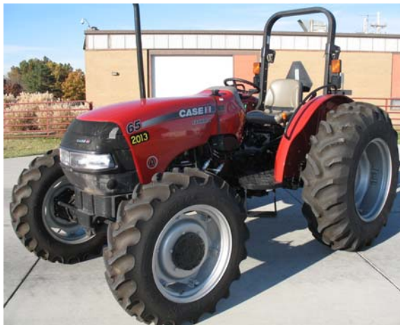
Case IH Farmall 65A Diesel Institute of Agriculture and Natural Resources University of Nebraska-Lincoln