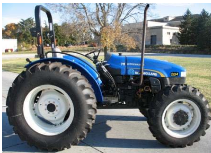
New Holland Workmaster 75 Diesel Institute of Agriculture and Natural Resources University of Nebraska-Lincoln