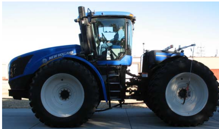
NEW HOLLAND T9.560 Diesel

Institute of Agriculture and Natural Resources University of Nebraska-Lincoln