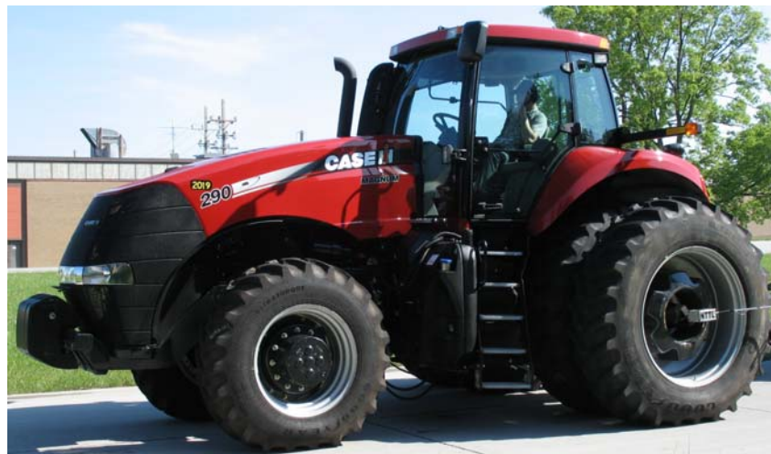
CASE IH MAGNUM 290 DIESEL