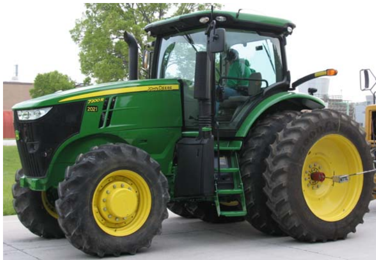
JOHN DEERE 7200R DIESEL

Institute of Agriculture and Natural Resources University of Nebraska–Lincoln