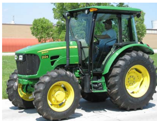
John Deere 5093E Ltd Diesel Institute of Agriculture and Natural Resources University of Nebraska-Lincoln