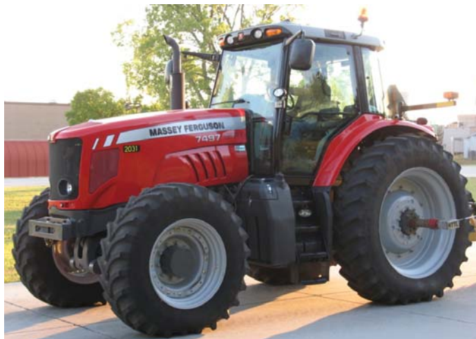
MASSEY FERGUSON 7497 Diesel