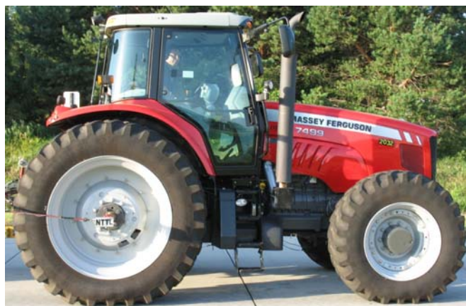
MASSEY FERGUSON 7499 Diesel