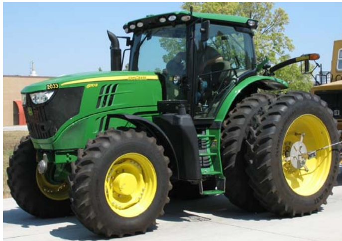
JOHN DEERE 6170R DIESEL

Institute of Agriculture and Natural Resources University of Nebraska–Lincoln