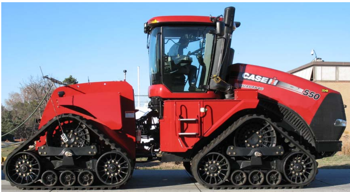
Case IH Steiger 550 Quadtrac Diesel

Institute of Agriculture and Natural Resources University of Nebraska-Lincoln