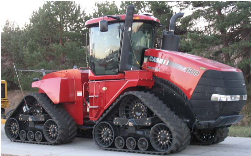
Case IH Steiger 600 Quadtrac Diesel