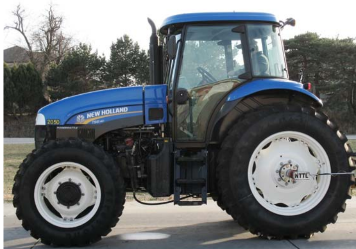
NEW HOLLAND TS6.140 DIESEL

Institute of Agriculture and Natural Resources University of Nebraska-Lincoln