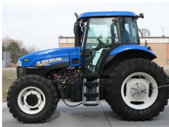
NEW HOLLAND TS6.125 DIESEL

Institute of Agriculture and Natural Resources University of Nebraska-Lincoln