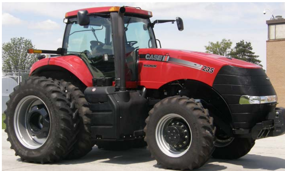
CASE IH MAGNUM 235 DIESEL