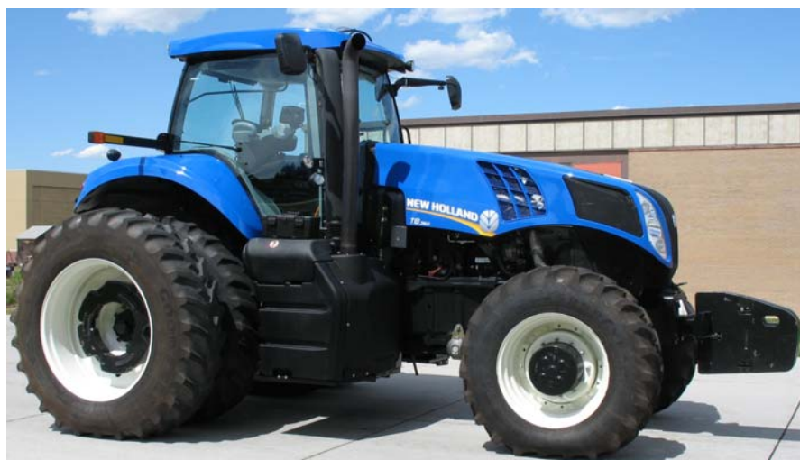
NEW HOLLAND T8.360 DIESEL