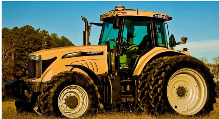
CHALLENGER MT595B Diesel