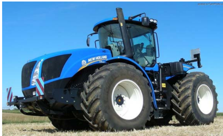
New Holland T9.450 Diesel

Institute of Agriculture and Natural Resources University of Nebraska-Lincoln