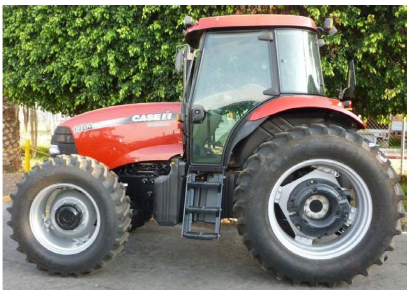
CASE IH FARMALL 140A DIESEL

Institute of Agriculture and Natural Resources University of Nebraska-Lincoln