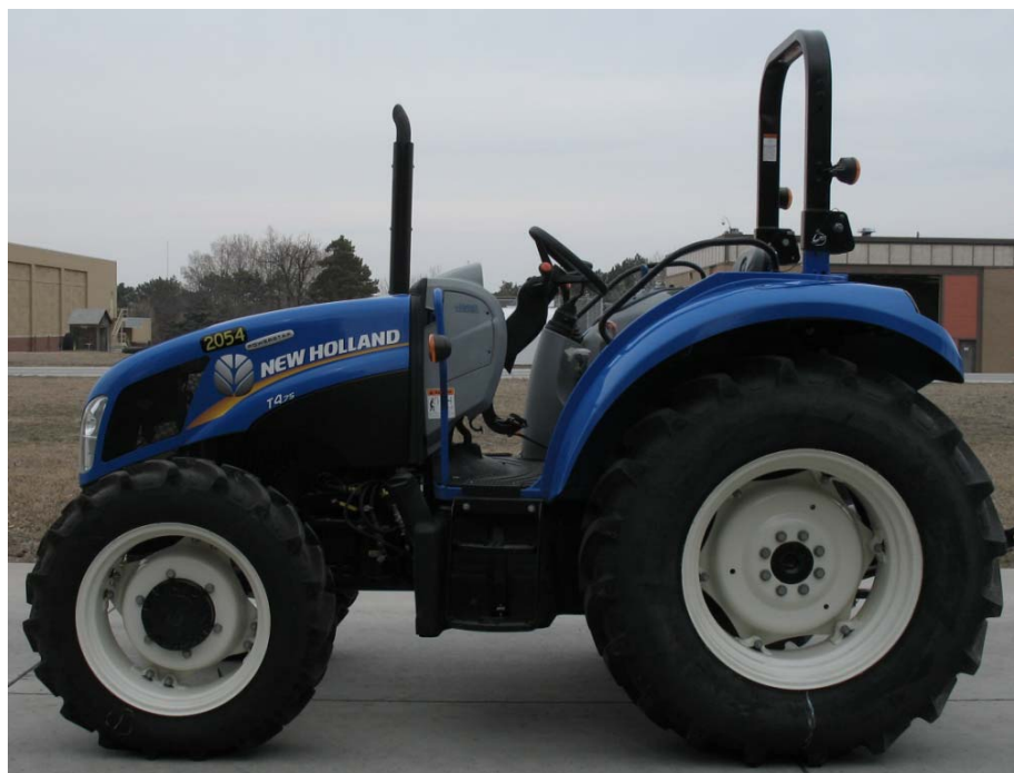
New Holland T4.75 Powerstar Diesel

Institute of Agriculture and Natural Resources University of Nebraska-Lincoln