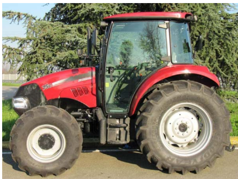
Case IH Farmall 75C Diesel