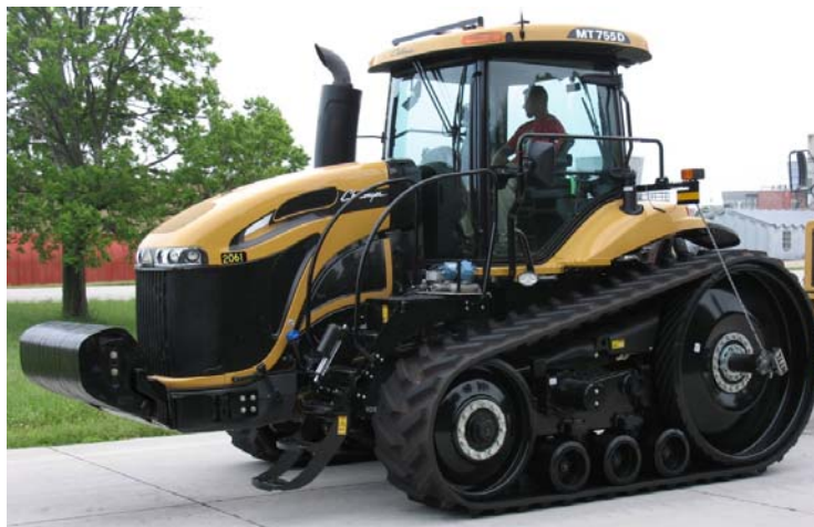
CHALLENGER MT755D DIESEL

Institute of Agriculture and Natural Resources University of Nebraska-Lincoln