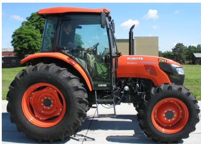
Kubota M9960 Diesel

Institute of Agriculture and Natural Resources University of Nebraska-Lincoln