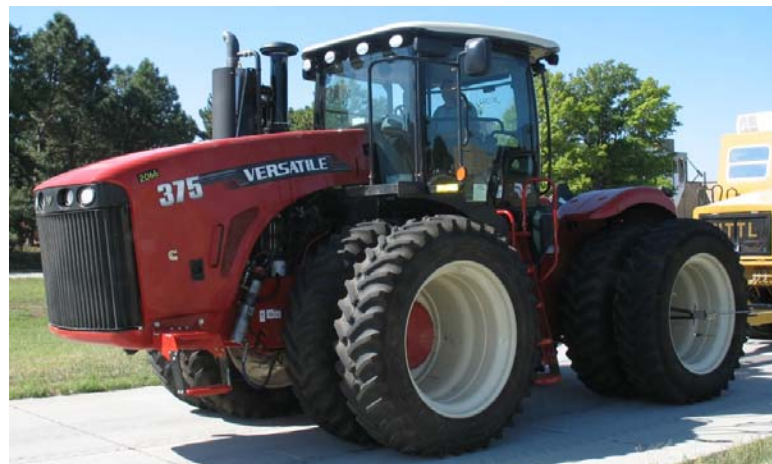
VERSATILE 375 DIESEL