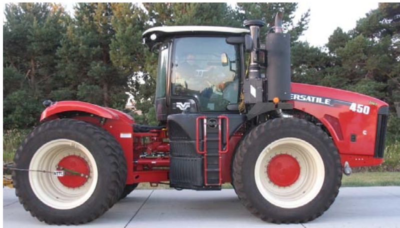
VERSATILE 450 DIESEL