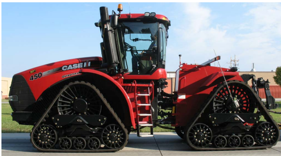
CASE IH Steiger Rowtrac 450 Diesel

Institute of Agriculture and Natural Resources University of Nebraska-Lincoln