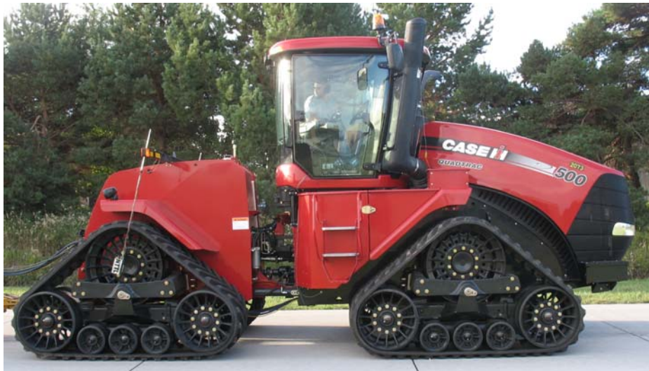
Case IH Quadtrac 500 Diesel

Institute of Agriculture and Natural Resources University of Nebraska-Lincoln