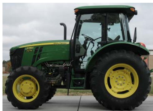
John Deere 5085E Diesel

Institute of Agriculture and Natural Resources University of Nebraska–Lincoln