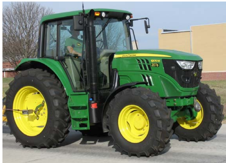
JOHN DEERE 6105M DIESEL

Institute of Agriculture and Natural Resources University of Nebraska—Lincoln