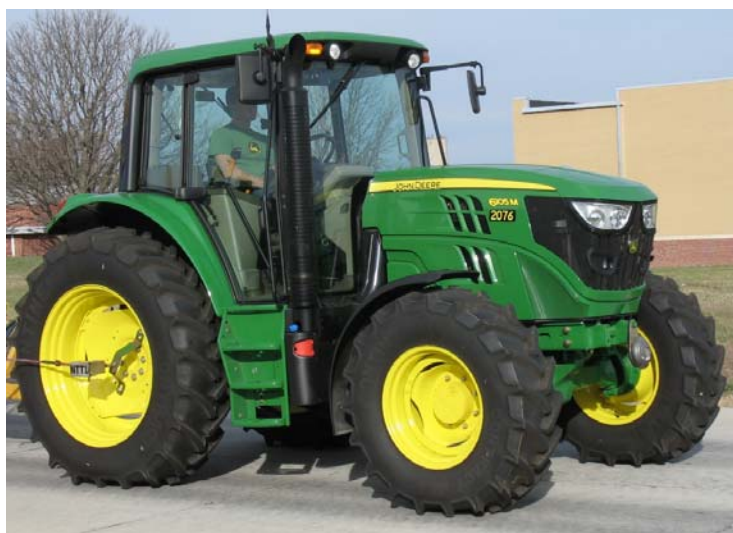
JOHN DEERE 6105M DIESEL

Institute of Agriculture and Natural Resources University of Nebraska—Lincoln