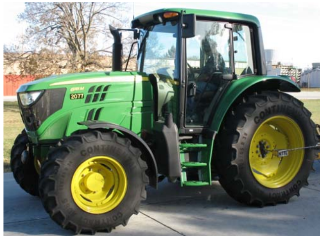
JOHN DEERE 6115M DIESEL

Institute of Agriculture and Natural Resources University of Nebraska—Lincoln