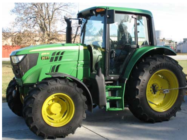
JOHN DEERE 6115M DIESEL

Institute of Agriculture and Natural Resources University of Nebraska–Lincoln