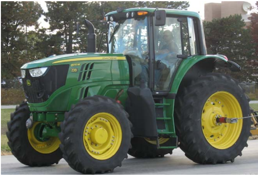
JOHN DEERE 6170M DIESEL

Institute of Agriculture and Natural Resources University of Nebraska–Lincoln