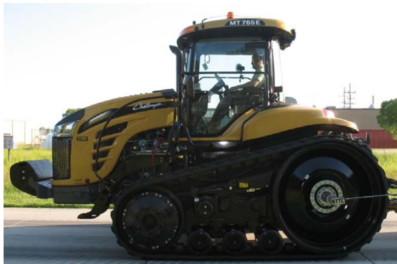
CHALLENGER MT765E DIESEL