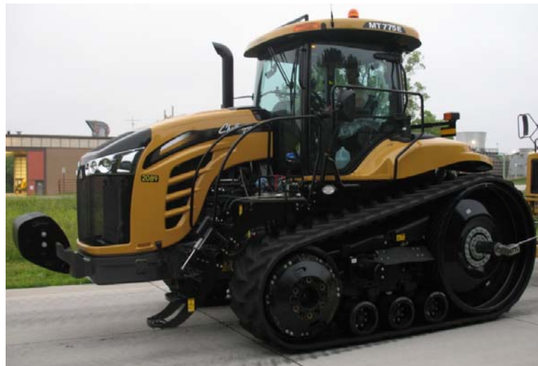
CHALLENGER MT775E DIESEL

Institute of Agriculture and Natural Resources University of Nebraska–Lincoln