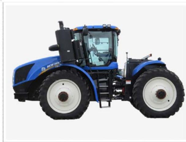
NEW HOLLAND T9.480 Diesel

Institute of Agriculture and Natural Resources University of Nebraska-Lincoln