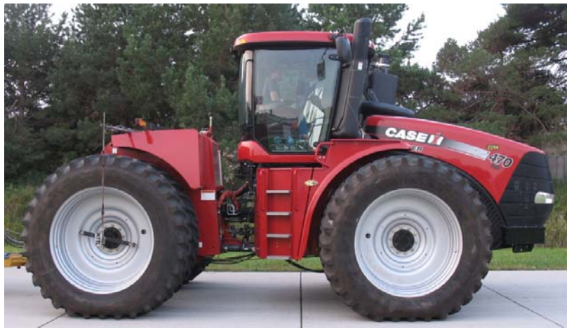
Case IH STEIGER 470 Diesel

Institute of Agriculture and Natural Resources University of Nebraska-Lincoln