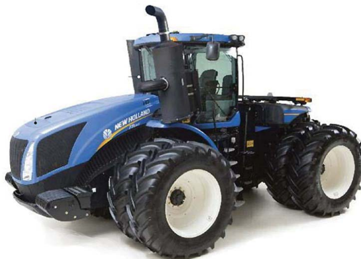
NEW HOLLAND T9.530 Diesel