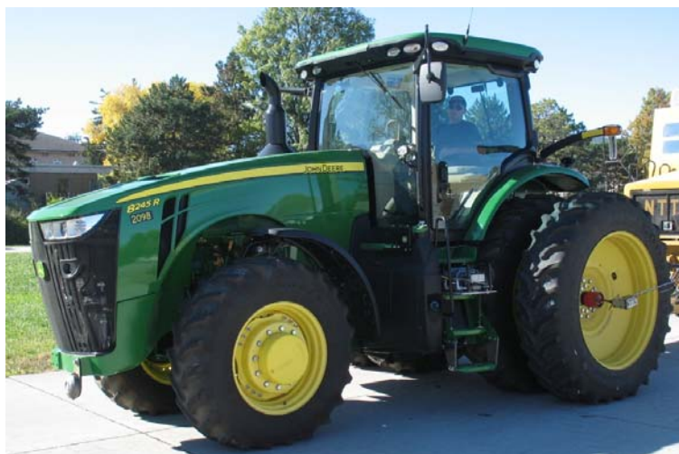
JOHN DEERE 8245R DIESEL