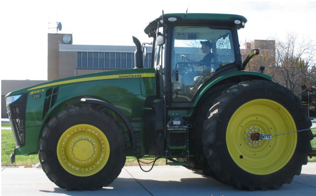
JOHN DEERE 8320R DIESEL