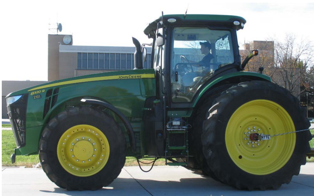
JOHN DEERE 8320R DIESEL

Institute of Agriculture and Natural Resources University of Nebraska-Lincoln