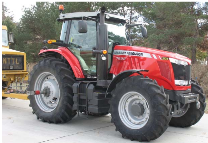
Massey Ferguson 7622 Diesel

Institute of Agriculture and Natural Resources University of Nebraska–Lincoln