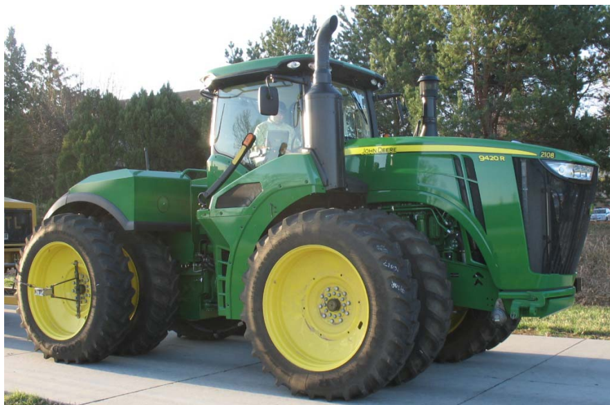
JOHN DEERE 9420R DIESEL