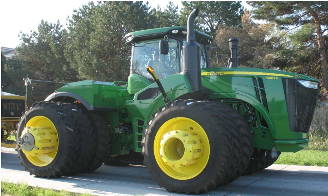
JOHN DEERE 9470R DIESEL