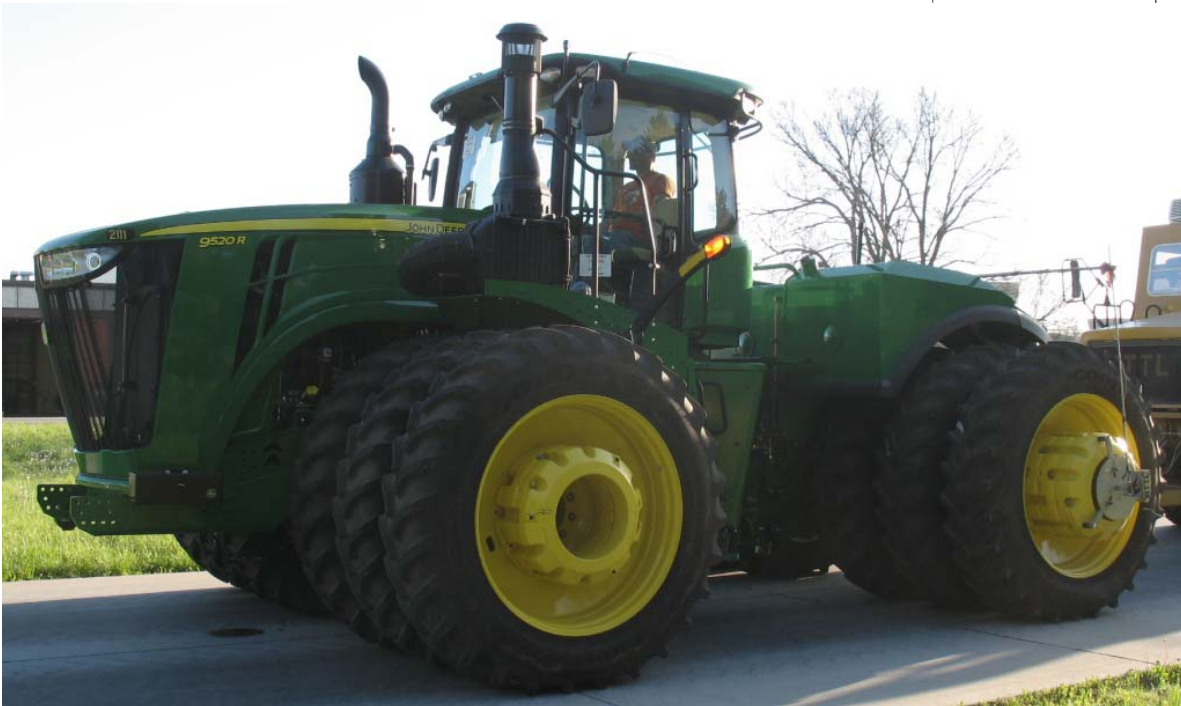
JOHN DEERE 9520R DIESEL