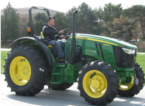
JOHN DEERE 5085M DIESEL Institute of Agriculture and Natural Resources University of Nebraska–Lincoln