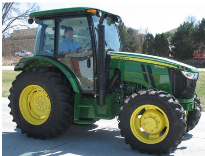
JOHN DEERE 5100M DIESEL Institute of Agriculture and Natural Resources University of Nebraska–Lincoln