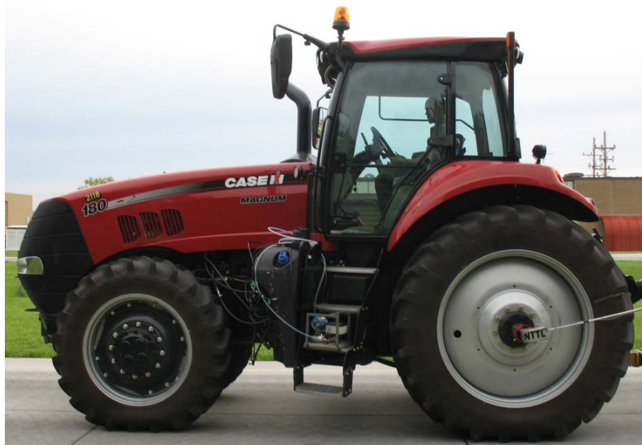
CASE IH MAGNUM 180 DIESEL