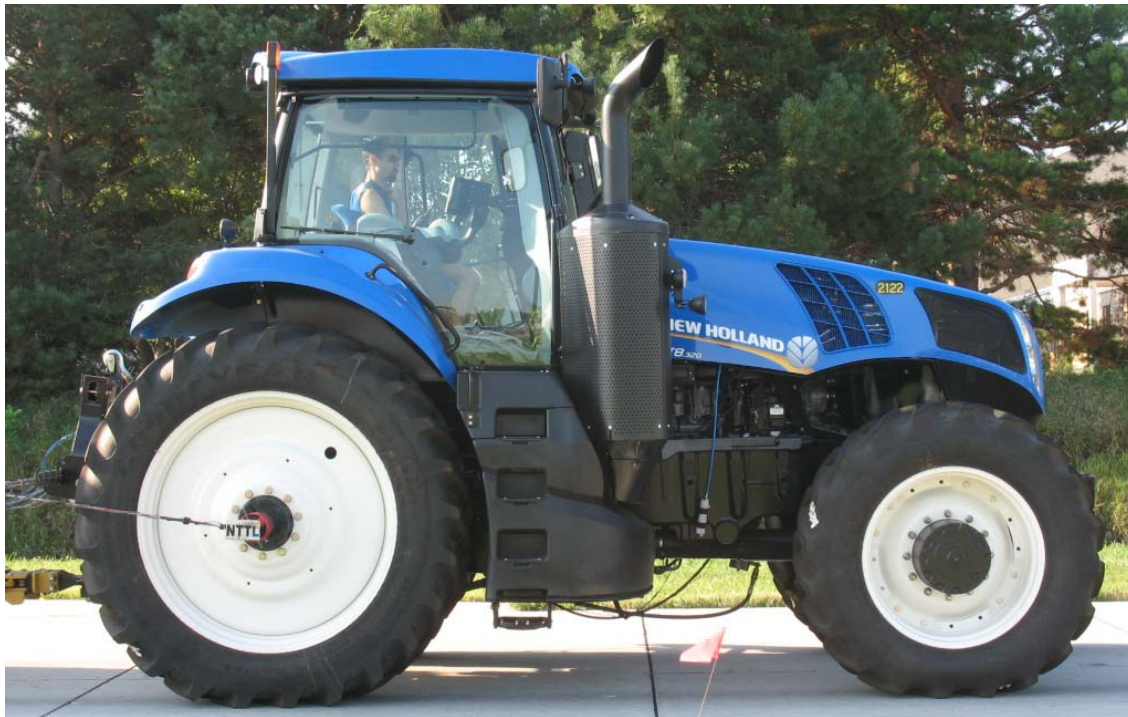
NEW HOLLAND T8.320 DIESEL