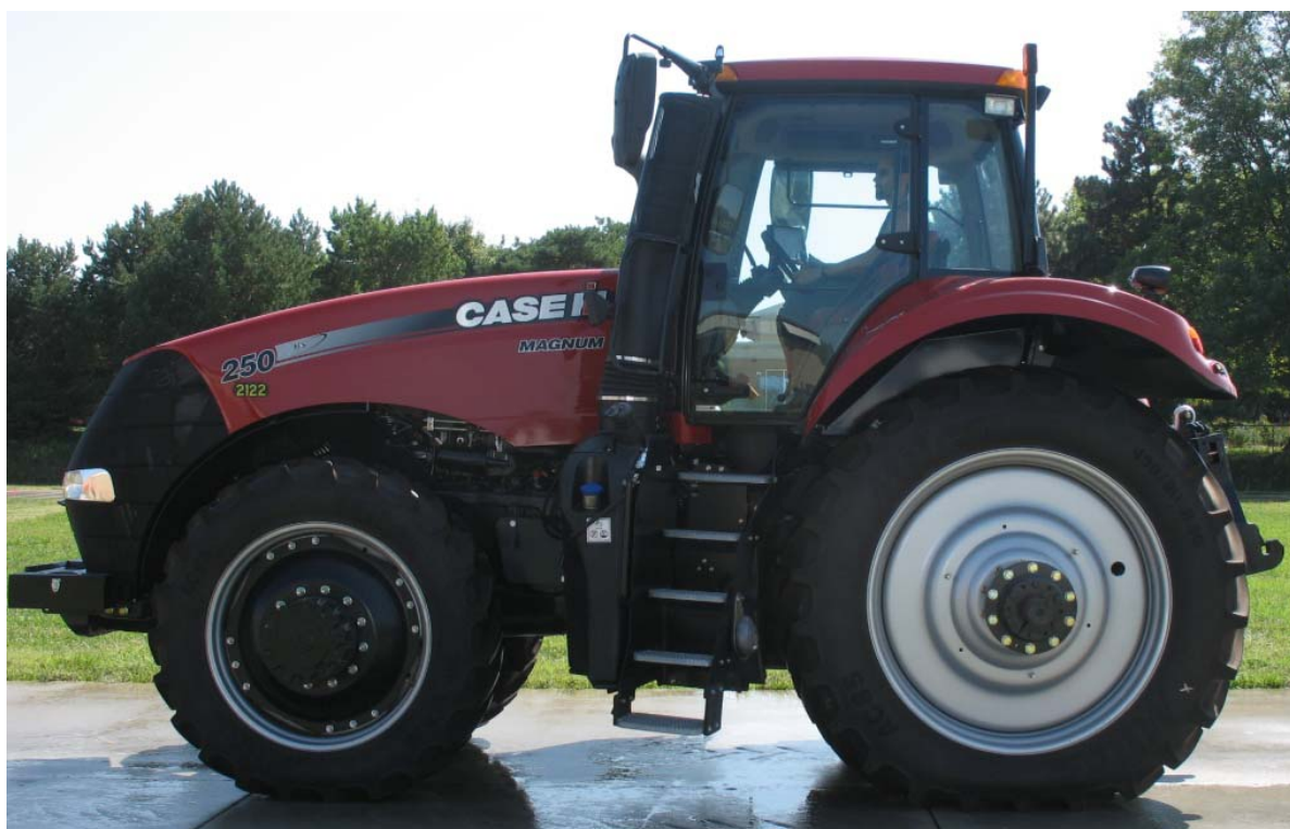
CASE IH MAGNUM 250 DIESEL