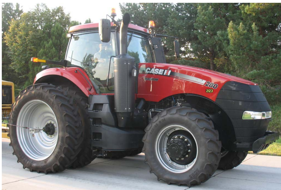
CASE IH MAGNUM 280 DIESEL